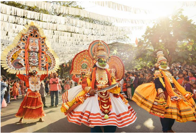
Traditional Kathakali dance on New Year carnival in Fort Kochi (Cochin), Kerala, India. Kochi, formerly known as Cochin, is a city and port in the Indian state of Kerala.

India's most Christian state, home to some of the country's finest beaches, erupts in a series of seaside festivities in late December. The port city of Kochi, for one, hosts a Christmas costume parade as well as midnight masses at the St. Francis Church, built in 1503, and the Gothic Santa Cruz Basilica, trimmed in colored lights. At the same time, year-end carnival festivities can last for up to two weeks.