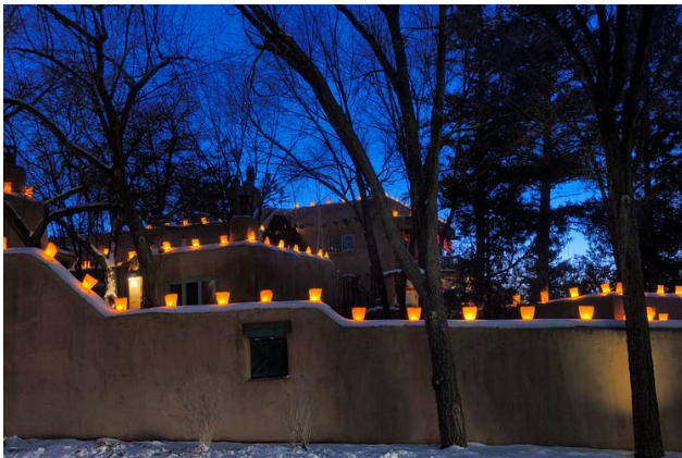
Farolitos on an adobe wall in Santa Fe.