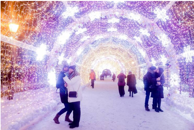
100-meter-long “Lights tunnel” at one of the venues of the Moscow Journey to Christmas festival in 2016.

In this land of deep snow, fur coats, pastel-painted medieval and Italianate buildings, and plentiful gut-warming vodka shots, the winter festivities recall the era of czarist excess. Dec. 25 is not a holiday in Moscow—Russians decorate trees and exchange presents on New Year's, while Christmas within the Russian Orthodox tradition falls on Jan. 7. But the city's winter festival starts on Dec. 22, and its eye-popping production values, 70 sites and more than 10,000 events are reason enough to visit. Among the holiday staples is the 8,000-square-foot skating rink that pops up in Novopushkinsky Square. There, between free public skate times, you can watch hourlong ice-ballets performed multiple times daily, some featuring Russia's figure-skating stars.