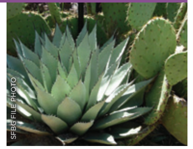
Agave parryi 'Parry's Agave'