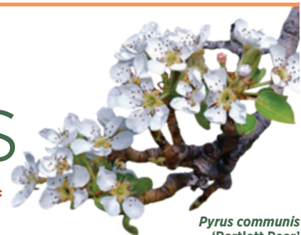
Pyrus communis 'Bartlett Pear'

*Although we have made every effort to assure the accuracy of each donor name on this list, we apologize if we have inadvertently made an error. Please let us know of any errors so that we may correct them immediately. Thank you.