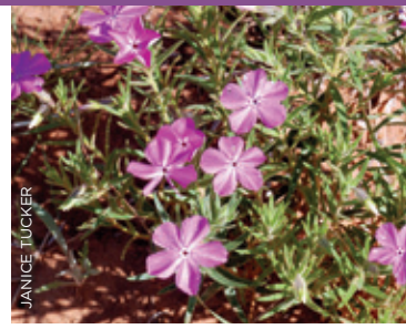
Phlox nana 'Santa Fe Phlox'