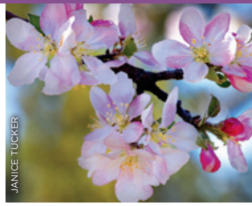
Malus Ginger Gold 'Ginger Gold Apple'