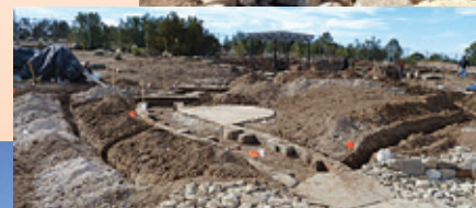
The Garden under construction.