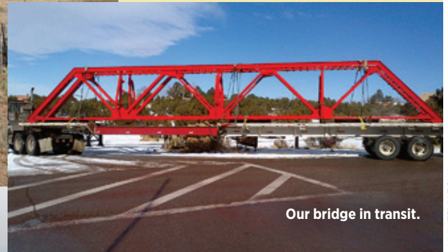
Our bridge in transit.